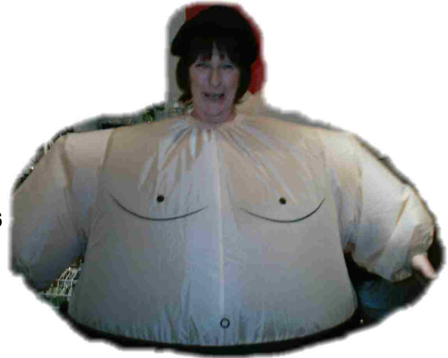
Seen in Penrhyn Bay on Christmas Day!